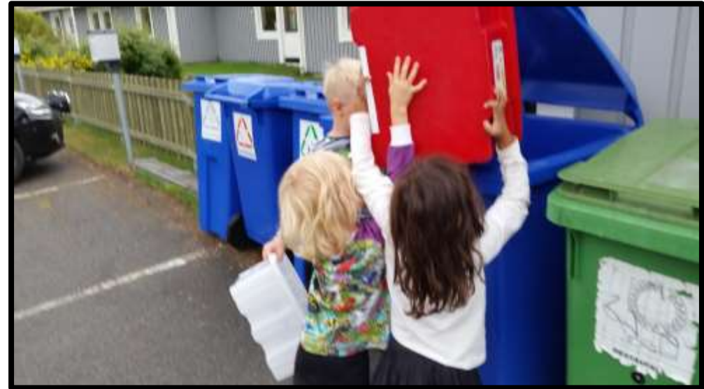
Ex. "learning about waste separation"