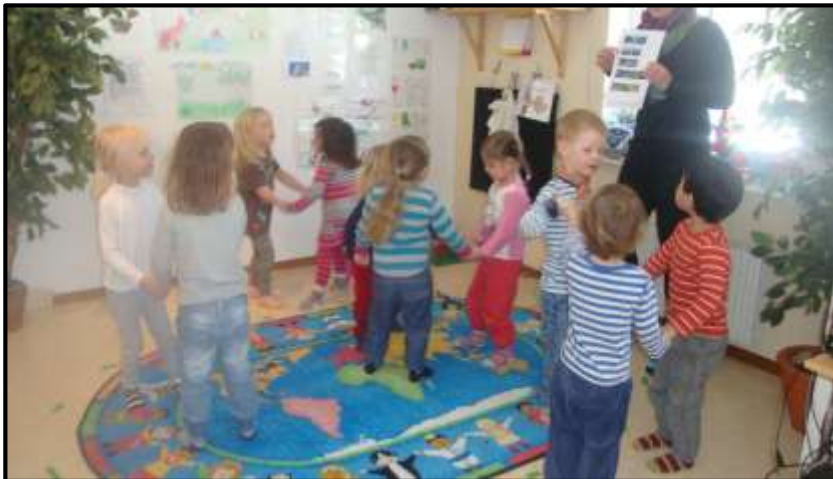
Ex. "Humanity and sustainable relationships"

Three perspectives in education for sustainable development ecologically, economically and socially