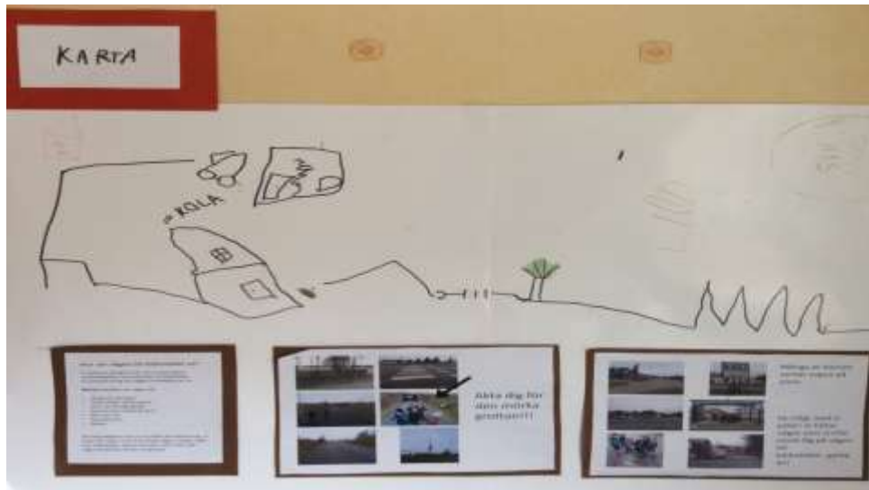
Ex. "Project on maps -lokalisera places"

The last two years we have worked with two focus areas in our municipality; Mathematics & Education for Sustainable Development