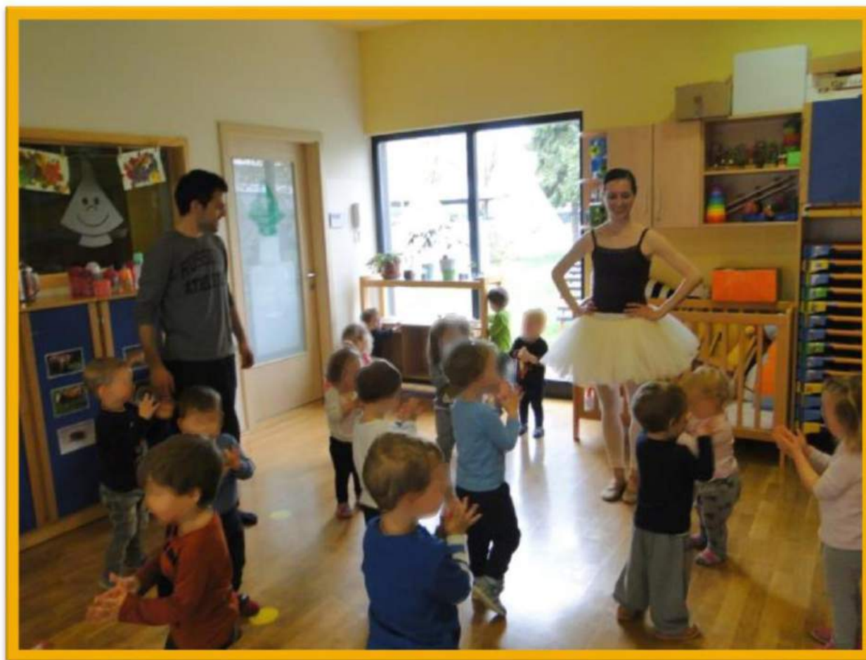
Presentation of occupation - balerina