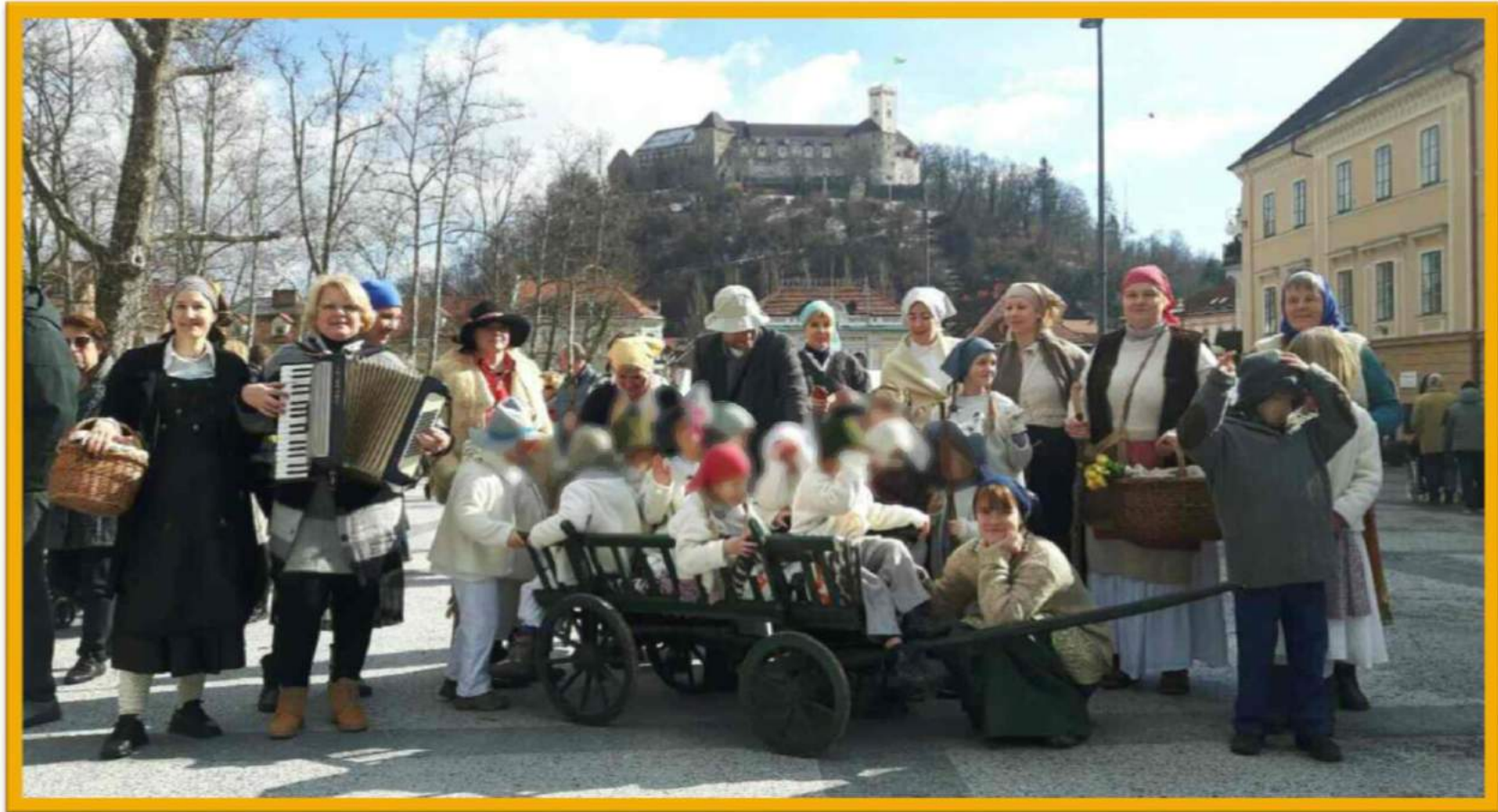
Municipality of Ljubljana - Dragons carnival