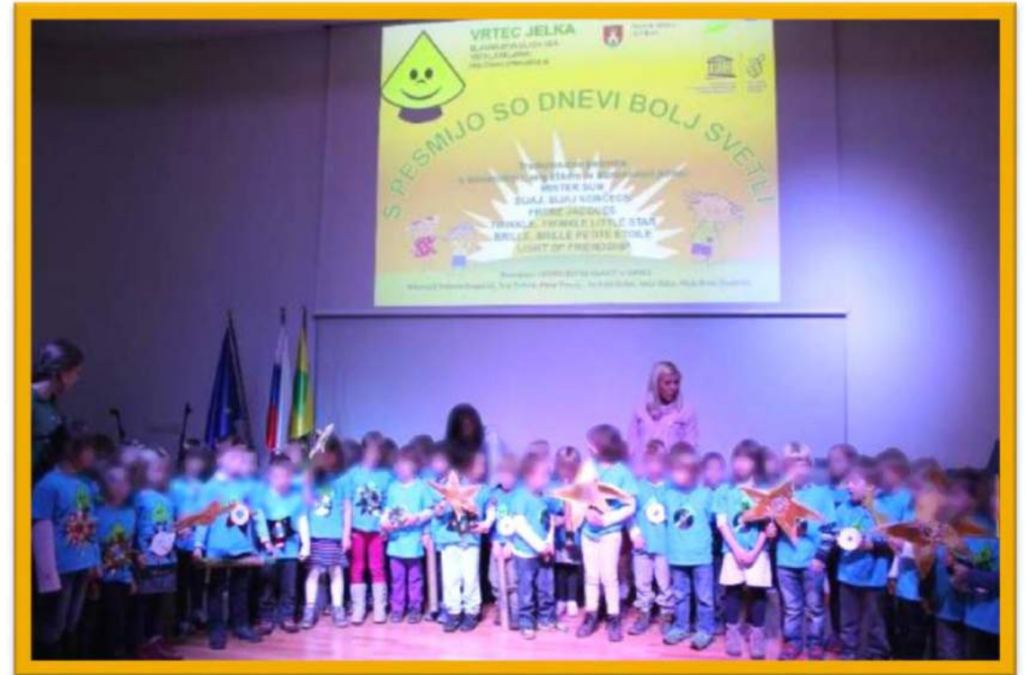
Day of languages - Visiting Škofja Loka